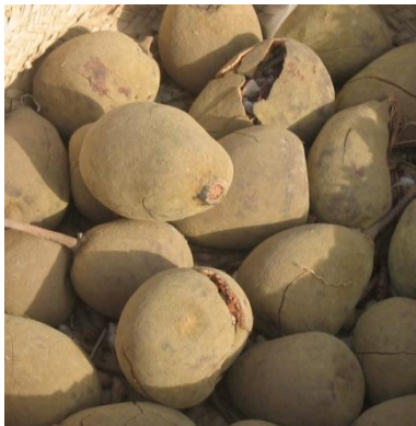
Plate.18 .Boabab Fruit