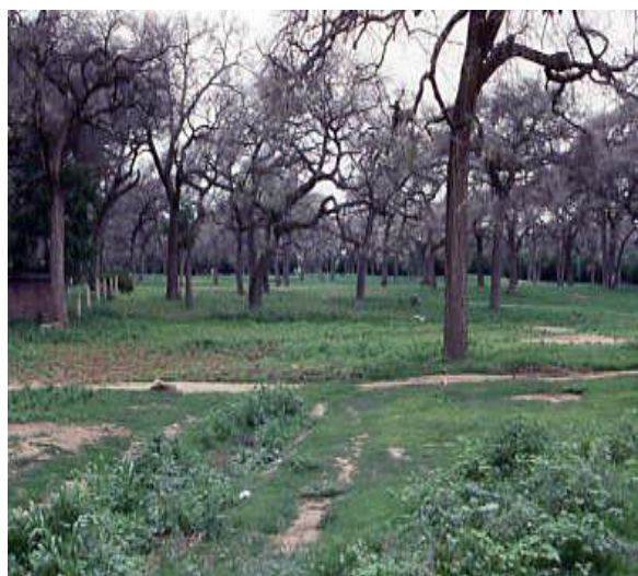
Plate (8). Haraz Agro-silvo-pastoral system

Communities in Darfur Region of Sudan have for generations deployed their knowledge of the phenology of such Acacias as Haraz ( Faidherbia albida ). It goes in sayings and proverbs of people of Darfur 'Haraz's animosity to rain'. Knowing that the trees shed their leaves during the rainy season, they sow their crops right to the tree bole with sufficient sun light penetrating through the open crown. After they harvest their crops in the summer, the trees flush their leaves and flower to yield thick shade and nutritious pods for livestock to seek as refuge and food source. In so doing the animals reciprocate by adding their 'animal manure', which together with the decomposed twigs and roots add to soil fertility; thus practising what we forestry science people took to the classroom and taught as 'agro-silvo-pasture',