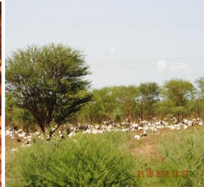
Plate. 23. Browse material