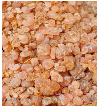
Plate.16. Gum Arabic