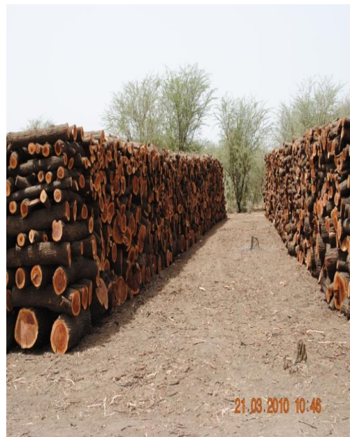
Plate (14). Firewood stack