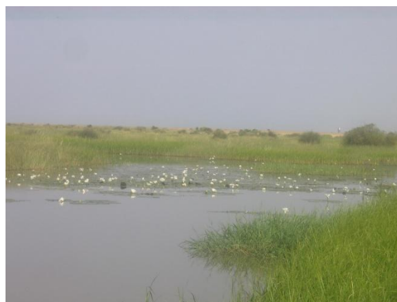
Plate (5).Acacia desert scrub River Nile State. Plate (6). Biodiversity: Water lilies W.N. State.