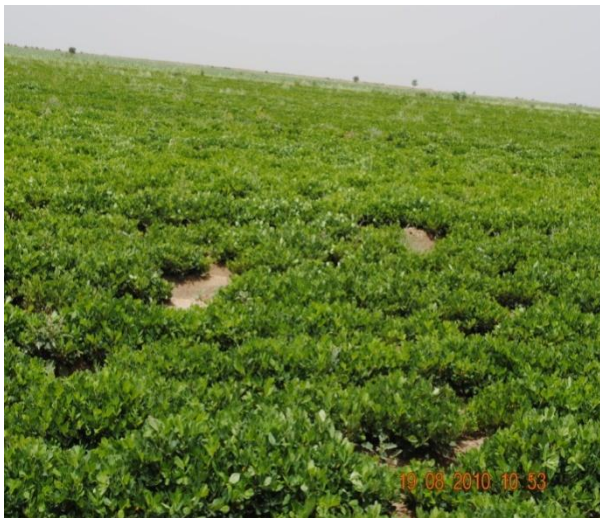
Plate (3). Ground nuts