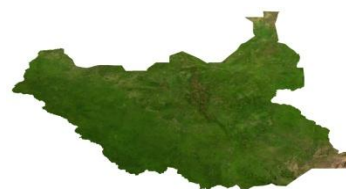
Map 3: Republic of South Sudan