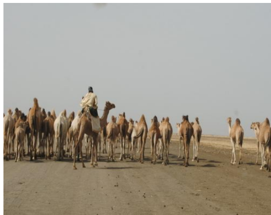
Camel herd Gadaref