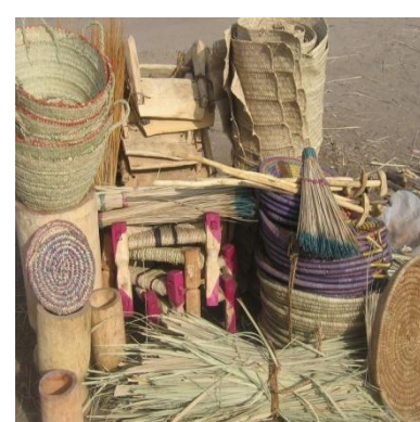
Plate.20. NWFPs handicrafts