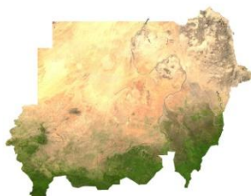
Map 2: Republic of Sudan, post 9 July 2011.

The Civil war was rekindled in 1983. The Comprehensive Peace Agreement signed between the Government of Sudan and South Sudan Liberation Movement (SPLM) and Army (SPLA) in 2005 which ended a 50 years civil war embodied a self-determination referendum. In the referendum which took place on January 9 th 2011, a majority of voters in Southern Sudan voted for cessation from Sudan Republic. Six month later, on July 9 th the whole world starting with the Government of Sudan recognized the Republic of South Sudan (RSS) as member n o 193 of the United Nations and member n o 54 of the African Union. Maps 2 and 3.