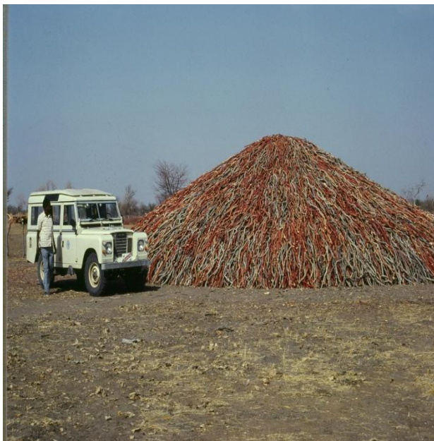
Plate (13). Charcoal kiln