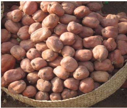
Plate.15. Dom Fruits

NWFPs on the other hand include a wide range of products such as browse & range material; ivory; bush meat; bee-honey & wax; gums & resins; bark derivatives such as tanning material; fruits, nuts & seeds (Box II.1).