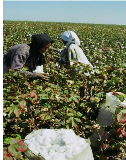
Plate (2). Cotton-Gezira

The main crops in the irrigated sector are sugar cane, sorghum, cotton, wheat, ground nuts, winter pulses, vegetables, fruit and green fodder. The sector uses the bulk of imported agricultural inputs (Anon 2000). Irrigation facilities are government owned. Land is under government control and is allocated to tenants in holdings of 15-40 fed. Production relations are based on water rate and administration. These are undergoing drastic changes especially in Gezira Scheme.