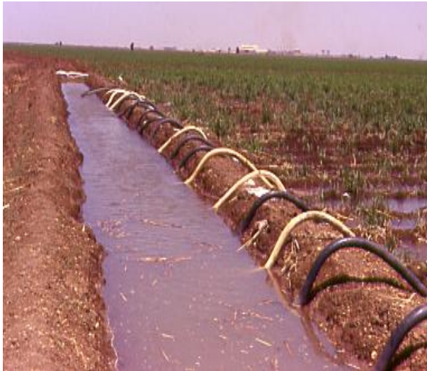
Plate (1). Long Farrow irrigation -Kenana Sugar.