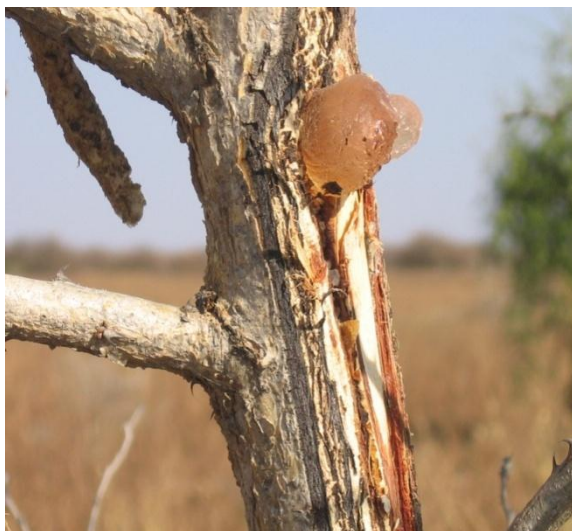
Plate (9). Gum tapping