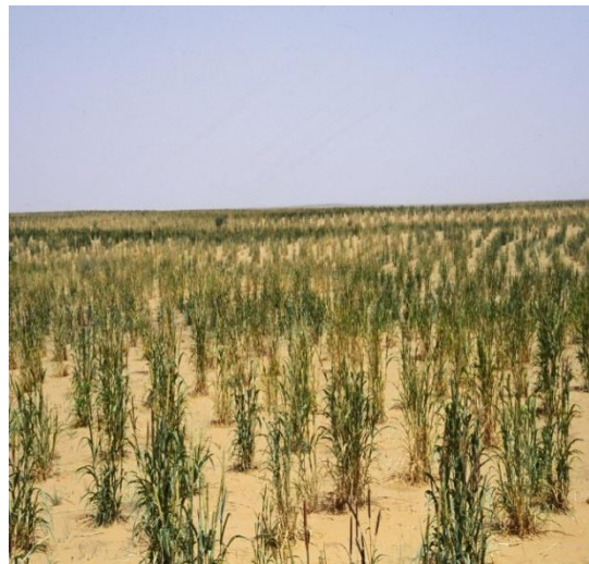
Plate (4). Traditional rain-fed millet

Land is government owned and is leased to investors for 25 year periods in holdings of 1000, 1500 and 2000 feddans for individuals, cooperatives and companies respectively. These may reach 100,000 fed for big companies. Individual holdings make some 78% of all holdings and 65% of entire area.