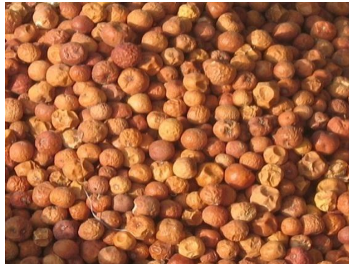
Plate. 22. Ziziphus fruit