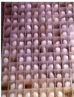
Plate.21. Silkworm cocoons