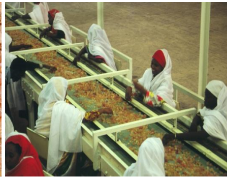
Plate.17. Gum Sorting