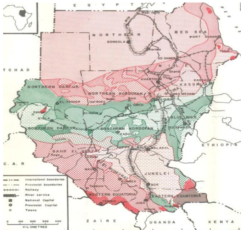
Map 4. Ecological classification of vegetation of Sudan 1958

The forest extent and estate in the two brother countries can be extrapolated by super imposing the map of Harrison & Jackson's 1958 'Ecological Classification of the Vegetation of Sudan' (Harrison & Jackson 1958) on the maps of the two countries. Tables (II.4 & II.5).x.