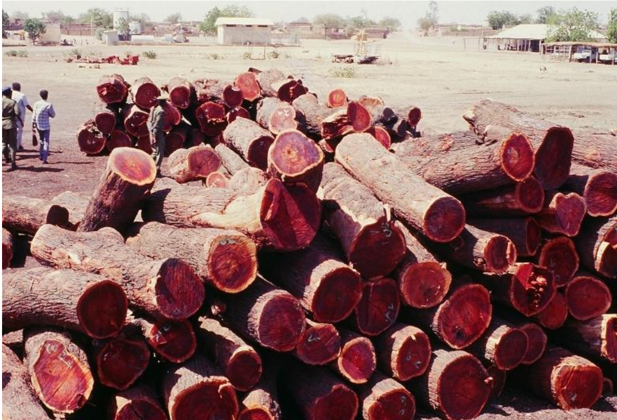
Plate (12). Sunt ( A. nilotica ) Saw logs