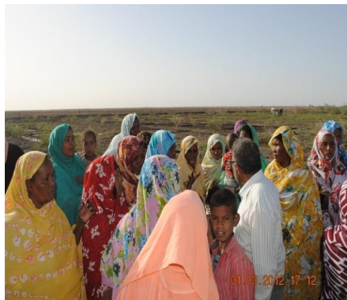
Women group irrigated forest White Nile